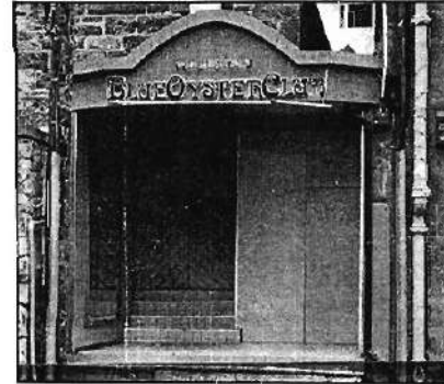
COME DANCING...the bar in Edinburgh where they danced