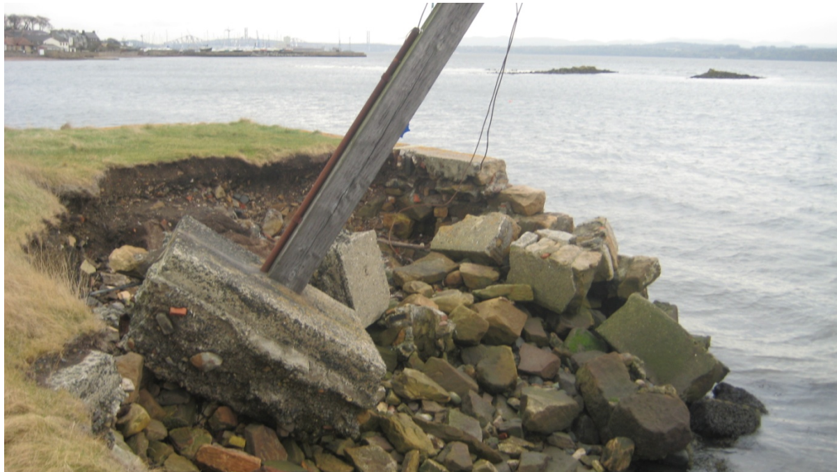
Parthenon it ain't