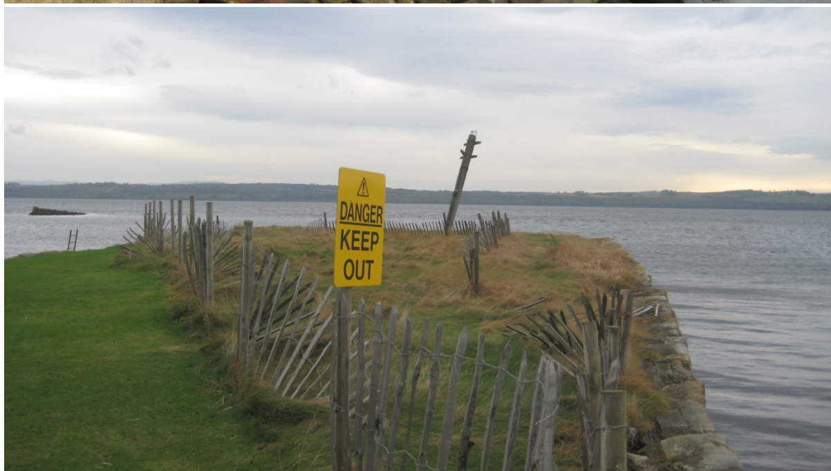
In good repair it ain't