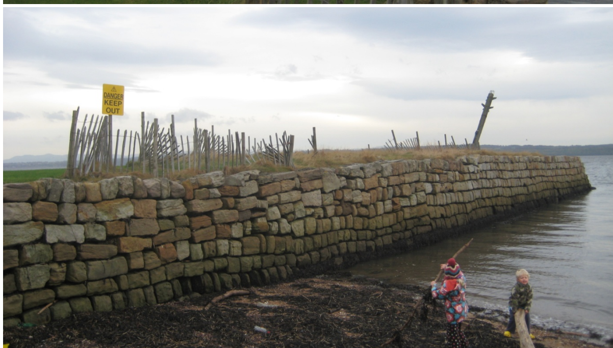
Was it bombed?

One would be forgiven for thinking that "One of the bombs fired by Morosini, the Venetian had struck it, but it is simply a case of neglect and lack of maintenance. The very things we were told the Greek people, under occupation by a foreign army were guilty of in Athens in 1801.